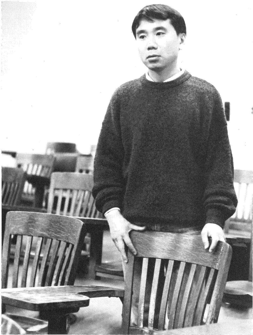
1. Haruki Murakami in a Jones Hall classroom, Princeton University, 1991