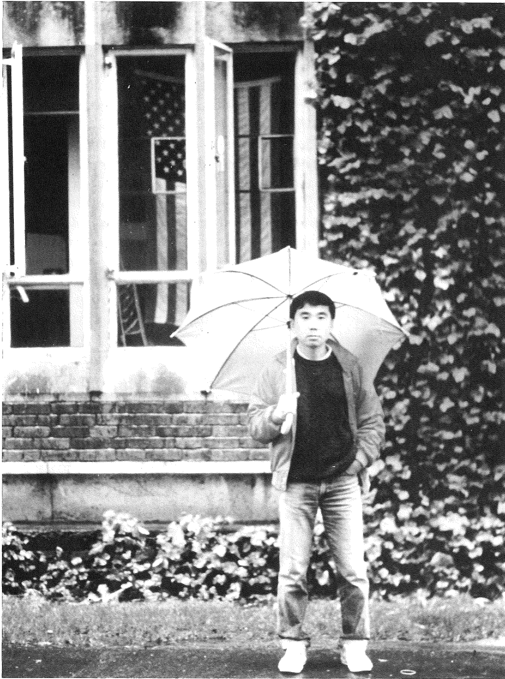
2. Haruki Murakami, Princeton University campus, 1991